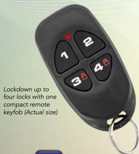
Lockdown up to four locks with one compact remote keyfob (Actual size)